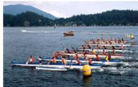
Moving together towards success!